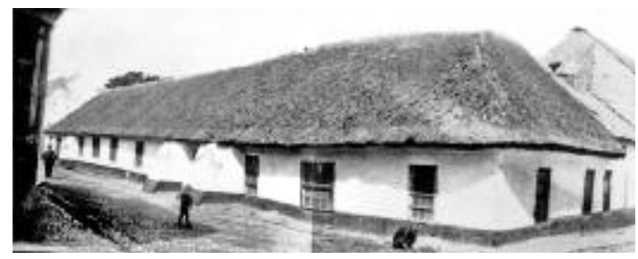
Figs 5,6 & 7

The domestic weavers brought their webs to weekly brown linen markets in the centres of weaving in Ulster where dealers or bleachers bought them to have them bleached and finished before taking them to the Linen Hall in Dublin for sale to English merchants. (Fig 7) shows brown linen being bought at an Ulster market.